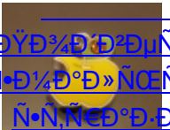
ДŸД³/⁴Д´Д²ДµÑ·Д°Д, Ñ· Д¹/⁴Д°Д»Ñ€Ñž, Ñ·Д³/⁴ Ñ·Ñ·Ñ€Д°Д·Д°Д¹/⁴Д, (142)