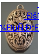
ДšÑfД» Д¹/⁴ДµÑ·Д°Д»Д·Д» (15)