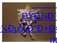
ДŸД³/⁴Д´Д²ДµÑ·Д°Д, Д¹/⁴ДµÑ·Д·Д»Д·Ñ±ДµÑ·Д°Д, Дµ (86)